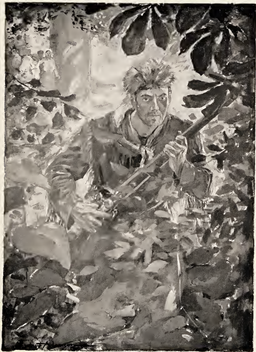
“HIS HAND NEAR THE TRIGGER OF HIS LONG DECKARD.”